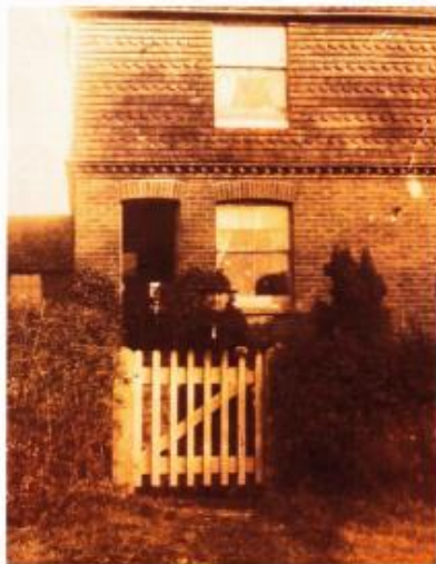
HERSTMONCEUX, COWBEECH, MAGHAM DOWN, AND WINDMILL HILL