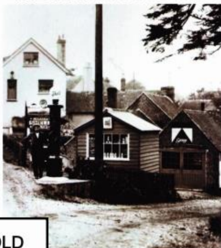
G, BOREHAM STREET, WINDMILL HILL, AND BODLE STREET GREEN