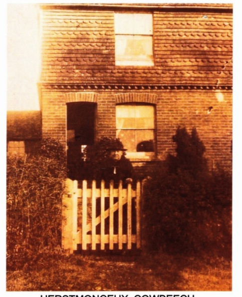
HERSTMONCEUX, COWBEECH, MAGHAM DOWN, AND WINDMILL HILL

Available from our usual outlets: Herstmonceux Post Office and Windmill Hill Stores, and Lime Cross Nursery (who stock most of our books)